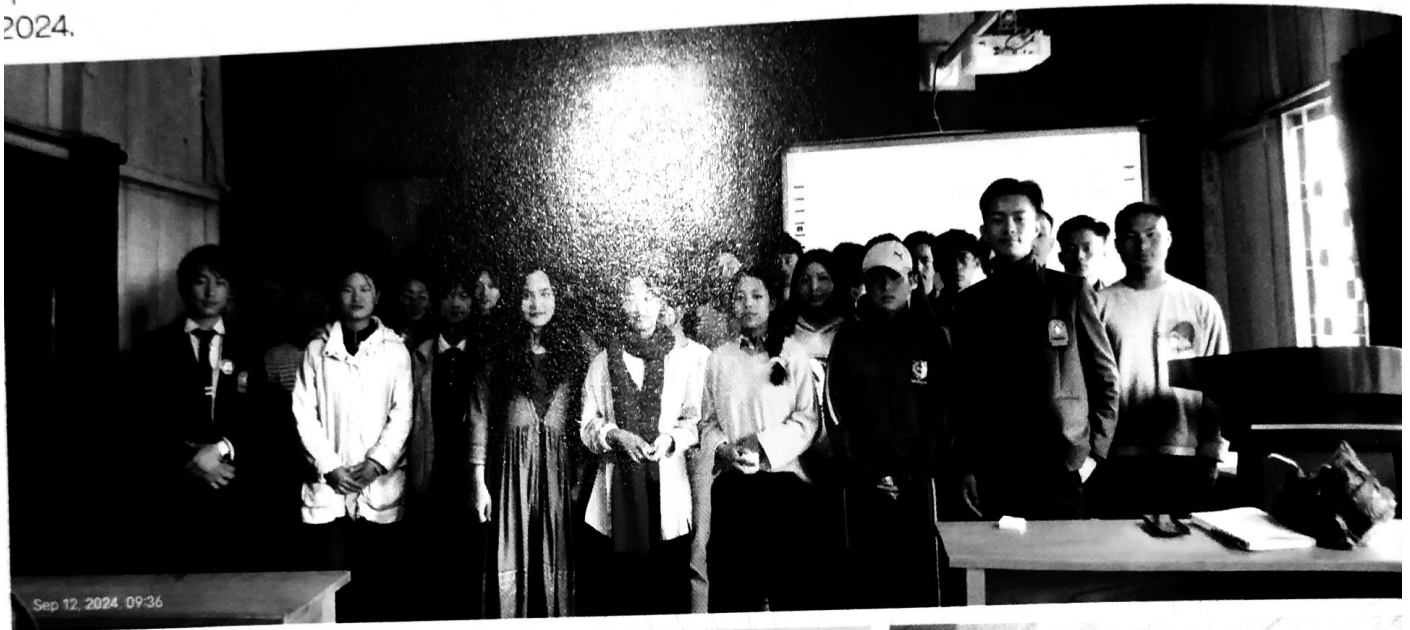
Sep 12, 2024 09:36

The Red Ribbon Committee, Pfutsero Government college organized a Marathon race with an aim to spread awareness on HIV/AIDS during the 42nd Annual Games and Sports Meet 2024 on 25th September 2024.