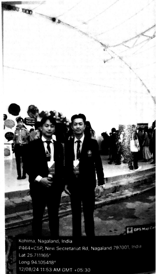
Kohima, Nagaland, India P464+C5P, New Secretariat Rd, Nagaland 797001, India Lat 25.711165° Long 94.105418° 12/08/24 11:53 AM GMT +05:30